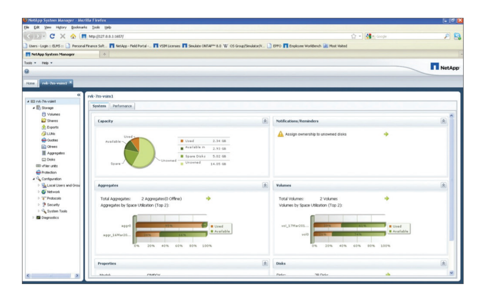
Figure 2) You don't need to be an expert to configure your storage with the simple, easy-to-use NetApp System Manager Console.

Terremark, AT&T, Rackspace, ACS, and T-Systems, and innovative partners such as Blue River IT that offer cutting edge solutions based on NetApp Private Storage for Amazon Web Services. Built on a universal data platform, equipped with data portability technologies, NetApp-based cloud solutions enable seamless movement of data in and out of the cloud. So you can manage and control your data with confidence and prevent vendor lock-in.